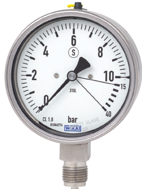
Bourdon tube pressure gauge model 232.36