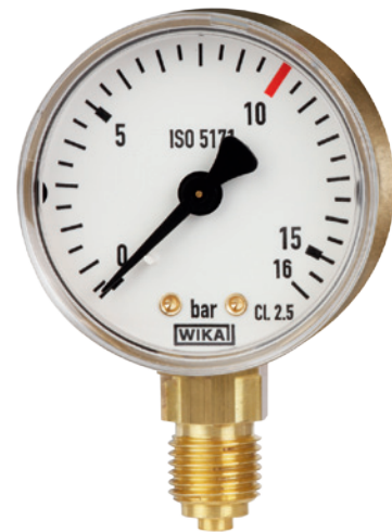
Bourdon tube pressure gauge model 111.11